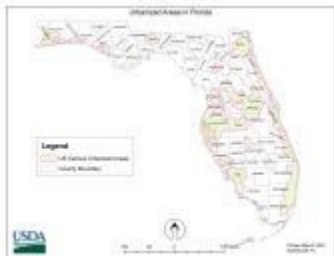
Map of U.S. Census urbanized areas in Florida

Photo caption (above), photo of high tunnel used for in-ground crop production.