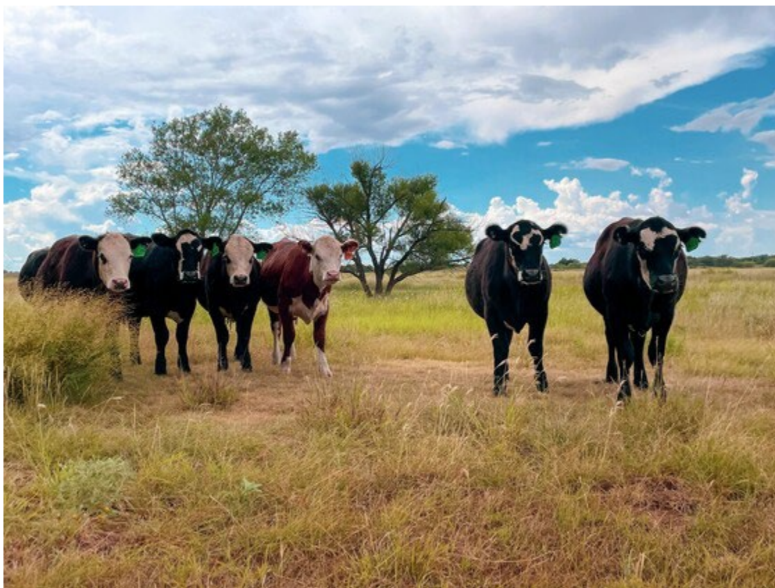
To enter a photo in this month's contest, email the full resolution photo to NRCSinfo-OK@usda.gov